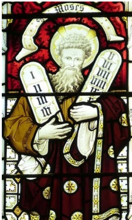
Moses & The Ten Commandments.