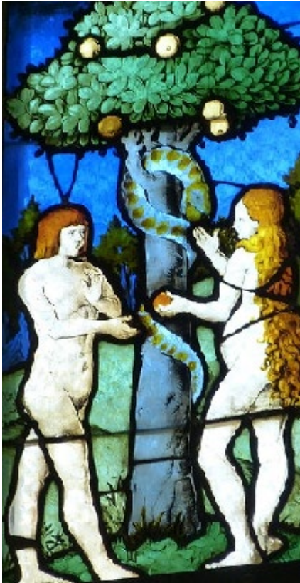
Adam & Eve & The Serpent